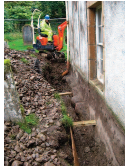
opening up south wall drainage trench

The old coating and bottom metre of cement harling has been chipped off, and a new breathable lime coating used to line the drainage channel before putting in new pipework.