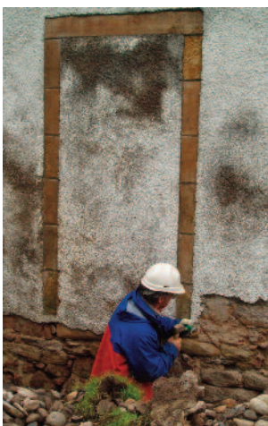
Paddy removing harling by earlier south wall door opening. This would have led to the west loft