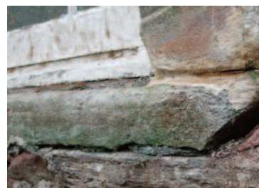
slate pinning used below window sill