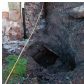
older stone lined drainage by north porch